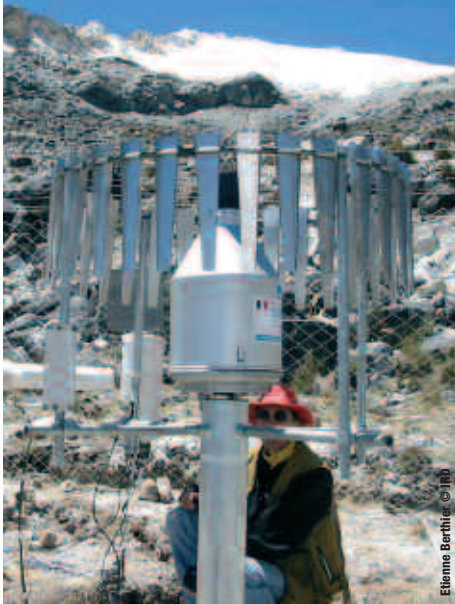
Charquini Glacier 4800m, Bolivia