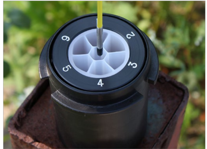
Measure water levels within the narrow channels of a Solinst CMT® System.

The 102M Mini Water Level Meter is available in 25 m and 80 ft lengths. There is the choice of the P4 or P10 Probe.