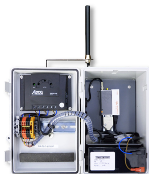
3G-DLC-BX1/SP and 3G-BX1/SP Modem Box