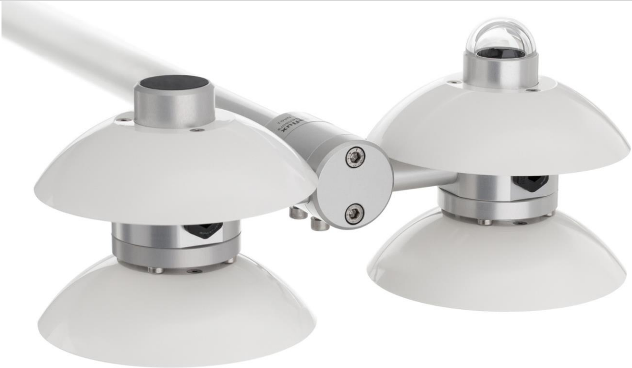
Figure 1 NR01 4-component net radiometer

NR01 is a market leading 4-component net radiation sensor, mostly used in scientific-grade energy balance and surface flux studies. It offers 4 separate measurements of global and reflected solar and downwelling and upwelling longwave radiation, using 2 sensors facing up and 2 facing down. NR01 owes its popularity to its excellent price / performance ratio. Advantages include its modular design with 2 pairs of identical sensors, low weight, ease of levelling, and low solar offsets in the longwave measurement. The unique capability to heat the pyrgometers reduces measurement errors caused by dew deposition.