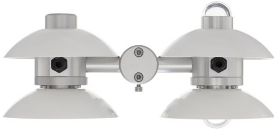
Figure 4 NR01 4-component net radiometer, including two pyranometers, two pyrgeometers, heater and 2-axis levelling assembly (mounting tube not included)