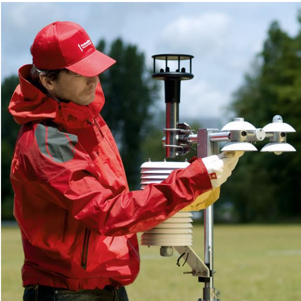
Figure 2 NR01 in use in a typical meteorological station