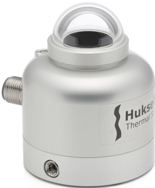
Figure 1 SR05-D1A3-PV pyranometer

SR05 series is the most affordable range of pyranometers meeting ISO 9060 requirements. These sensors are ideal for general solar radiation measurements and popular for monitoring PV systems. Model SR05-D1A3-PV is made as a perfect alternative to PV reference cells. It offers the same Modbus interface as the most common PV reference cell model for easy compatibility. Relative to PV reference cells, SR05-D1A3-PV has the advantage of higher stability, independence of the PV cell type or anti-reflection coating, and better availability and price of recalibration.