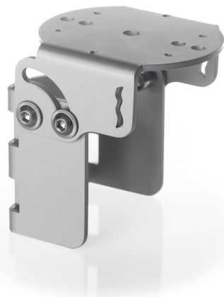
Figure 5 PMF01 mounting fixture accessory: practical, small footprint, and allowing horizontal and plane of array installations on various platforms