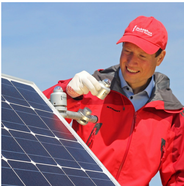
Figure 2 SR05's, one in PoA, replacing PV reference cells