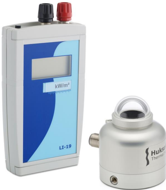
Figure 1 SR05-A1 pyranometer with LI19 handheld read-out unit / datalogger

SR05 is a solar radiation sensor that is applied in most common solar radiation observations. SR05-A1, with analogue millivolt output, complies with the spectrally flat Class C specifications of the ISO 9060 standard and the WMO Guide. LI19 is a high-accuracy handheld read-out unit / datalogger. The SR05-LI19 combination is well suited for mobile measurements and short term datalogging.