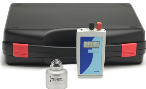
Figure 2 SR05-LI19 as it is delivered, in a practical transport case