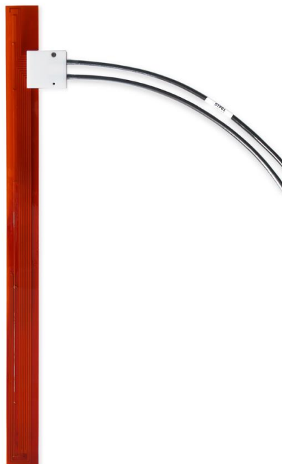
Figure 0.1 STP01. Standard cable length is 5 m.

Equipped with heavy duty cabling, and potted so that moisture does not penetrate the sensor, STP01 has proven to be very robust and stable. It survives long-term installation in soils. For ease of installation with a minimum of disturbance of the local soil, Hukseflux offers IT01 insertion tool.