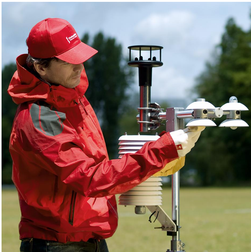
Figure 4.1 typical meteorological surface energy balance measurement system with STP01 installed in the soil

Usually this measurement is combined with measurements of the soil heat flux, soil thermal conductivity and soil heat capacity to estimate the heat flux at the soil surface. Knowing the heat flux at the soil surface, it is possible to "close the balance" and estimate the uncertainty of the measurement of the other (convective and evaporative) fluxes.