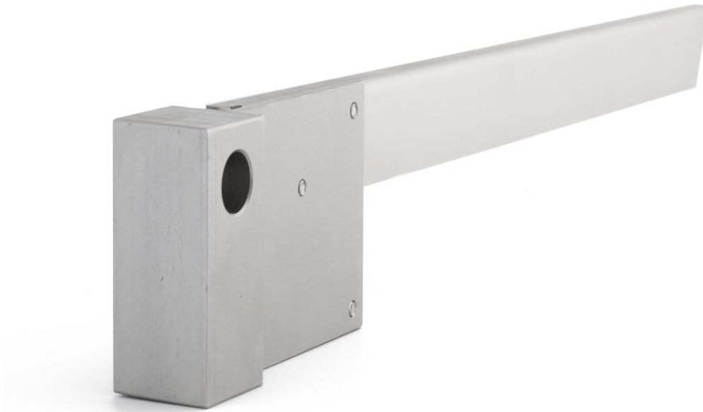
Figure 0.3 IT01 insertion tool is hammered down into the soil. After retracting it leaves a slit in which STP01 may be inserted.