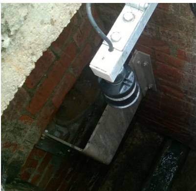
dBi HART on a CSO Application