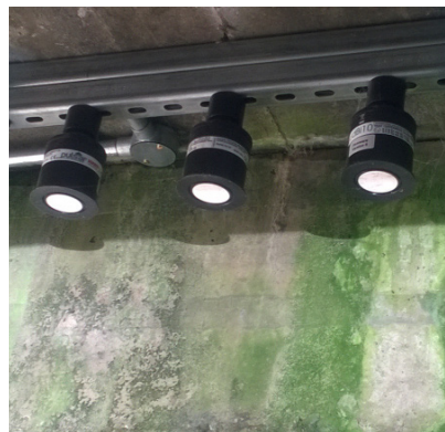
3 dBi HART transducers Monitoring Sluice Levels