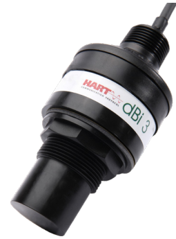
dBi3 HART Threaded Nose and PVDF Face

The first boot is approximately 8 seconds, if a typical 15-minute boot interval is used, this becomes approximately 3.5 seconds. The dBi transducers with HART will convert level to volume, and includes a library of typical tank shapes or a 16-point curve fit.