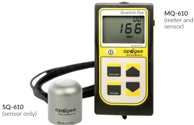
MQ-610 (meter and sensor)