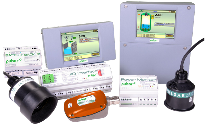
The Ultimate Controller Flow Group of Accessories

Ultimate also offers optional Wi-Fi connectivity allowing you to access, program, and interrogate the system wirelessly.