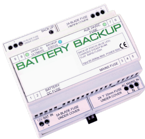
The Ultimate Controller Battery Backup Module

From Tariff Management to minimize your energy costs to Burst / Block alarms to Pump Prioritization based on efficiency. Pulsar Measurement's Ultimate Controller is packed with the advanced control features that bring effortless sophistication to pumping stations, meaning every installation can benefit from Pulsar Measurement's wealth of experience.